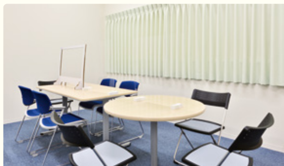
Rest room (Kyoto Uzumasa Campus)

For students who have difficulty in attending lectures or practical training, we provide support, representation, cooperation, and consultation with the Nurse's Office, Student Counselor's Office, and related faculty and staff.